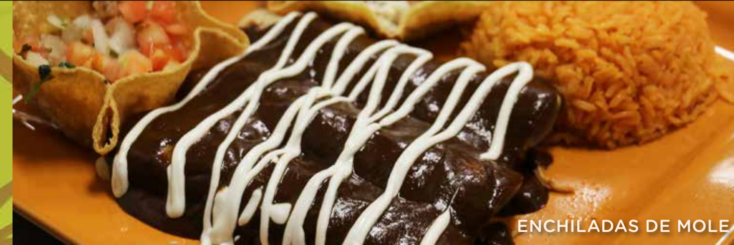
ENCHILADAS DE MOLE