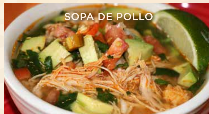
SOPA DE POLLO