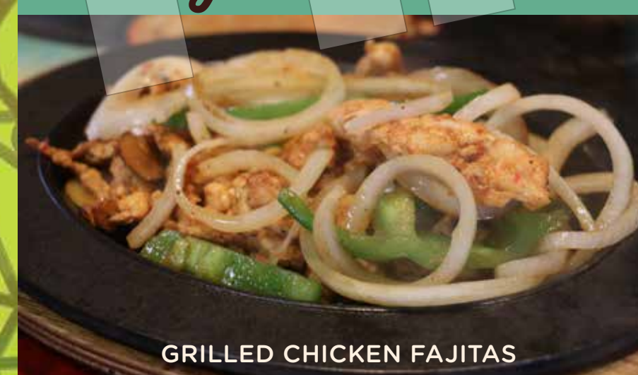
GRILLED CHICKEN FAJITAS

All fajitas are grilled with onions, mushrooms and bell peppers. Served with rice, refried beans, sour cream and your choice of flour or corn tortillas.