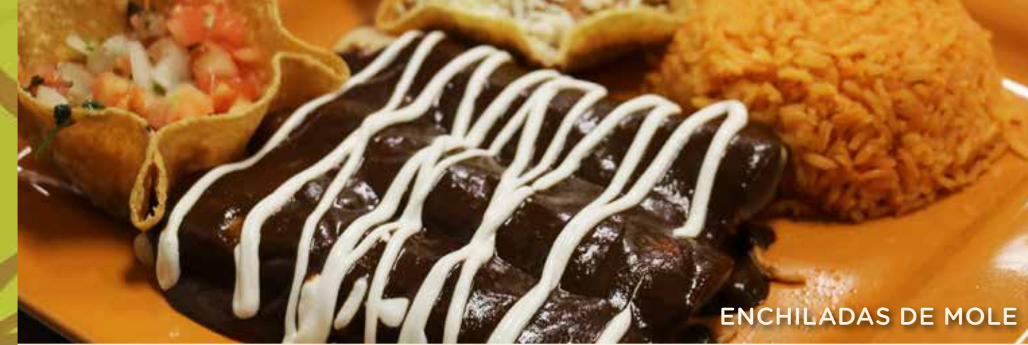
ENCHILADAS DE MOLE

C. ONE BEAN BURRITO, ONE CHEESE QUESADILLA AND REFRIED BEANS.