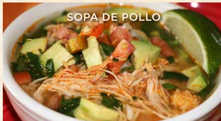
SOPA DE POLLO

Served with tortilla strips, pico de gallo, sour cream and cheese – 8.00