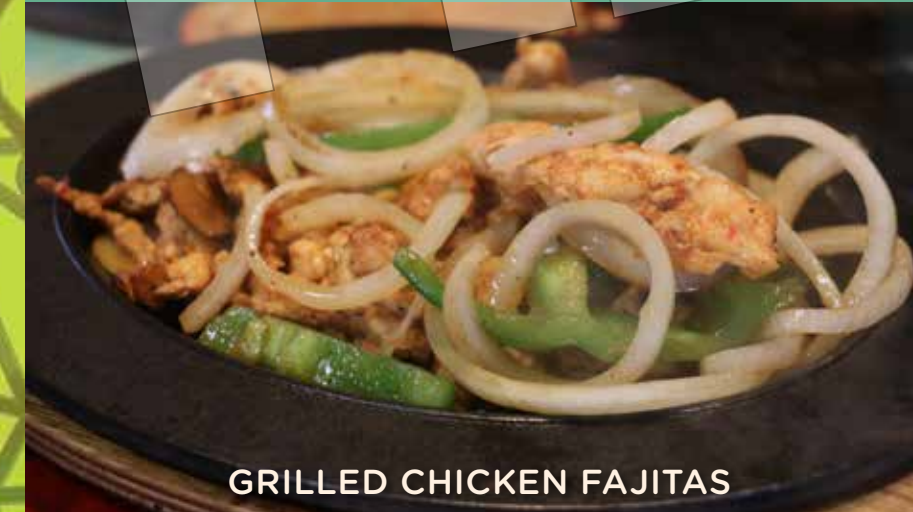
GRILLED CHICKEN FAJITAS

All fajitas are grilled with onions, mushrooms and bell peppers. Served with rice, refried beans, sour cream, shredded cheese and your choice of flour or corn tortillas.